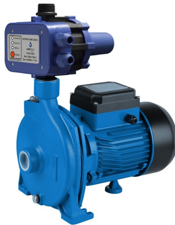
CPW Series pump with PS-01 controller Available for: CPW 180