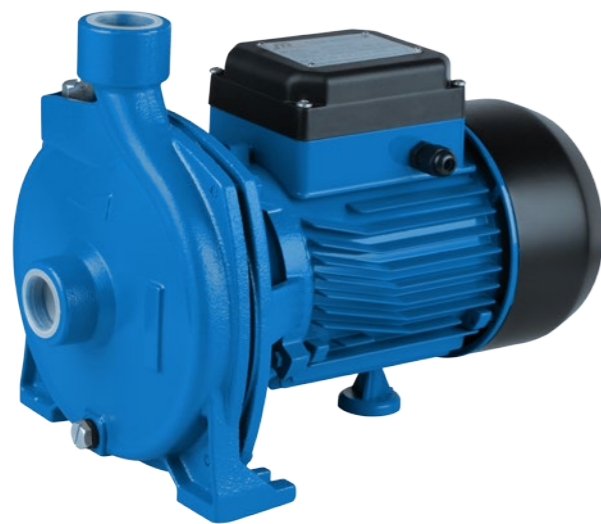
CPW Series pump