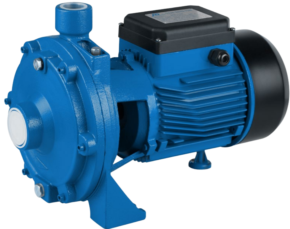
SCM 2 Series Dual Stages Centrifugal Pump