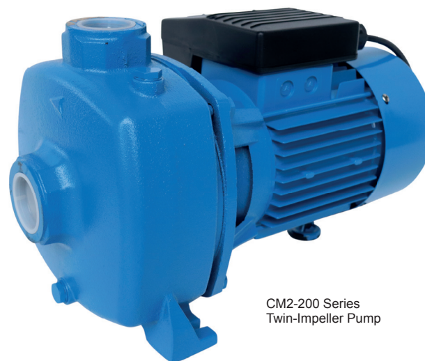
CM2-200 Series Twin-Impeller Pump